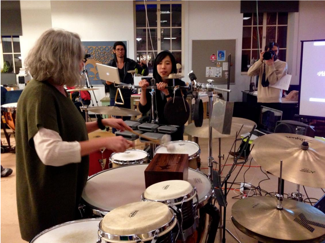
Studio Lab workshop in preparation to the Playing the Archive performance, February, 2013

In this performance, Schulkowsky and Baron read the graphic patterns of the eight pages of the Neoconcrete manifesto as a music score, assigning different sounds and rhythms to headlines, text columns, concrete poems, and photographs. And also by interpreting the white space of the pages as pauses. More than fifty years after its publication, we heard the rhythms of this remarkable work, which I continue to analyze.