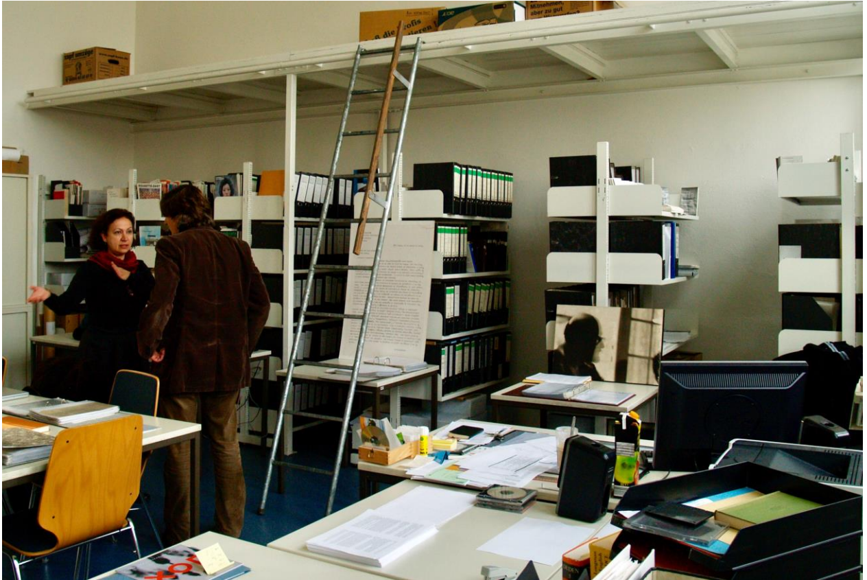
Visiting the Vilém Flusser Archive in Berlin in 2007