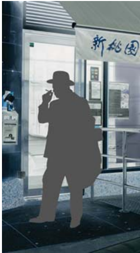
J. Goto, Sidney Bechet , Royal Philharmonic Hall, 1919