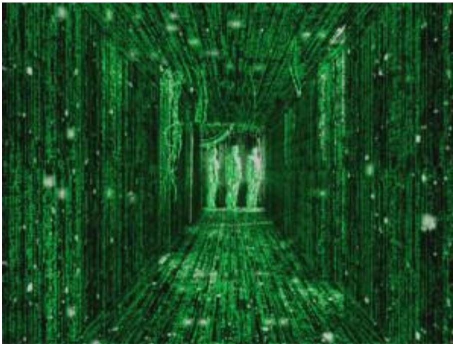
THE MATRIX (L. & L. Wachowski, 1999)

In the famous last scenes in the 1999 film THE MATRIX , where Neo, the hero, having understood that the phenomenal world he considered real is in fact a computer simulation, realizes that he can act inside the code , not only within the images (of the “real” world, projected by the machines directly into the brain of human beings). Neo is in THE MATRIX part of the code, but not completely determined by the program – a tricky constellation extended in the sequels.